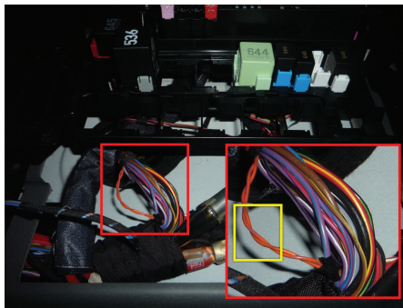
Figure 1. Connection to CAN-bus